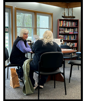
A resident speaking with one of the nurses