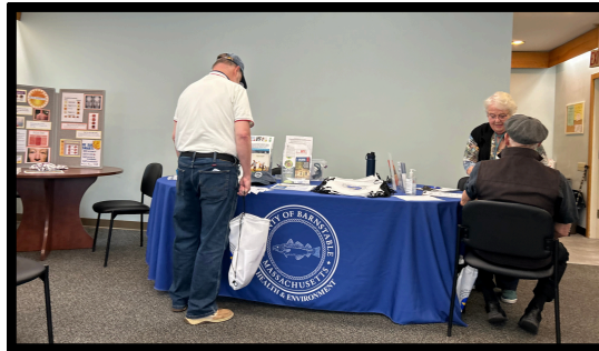
A resident checking out the free gifts