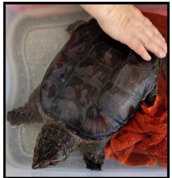
Mr. Snaps likes a reassuring hand on his back