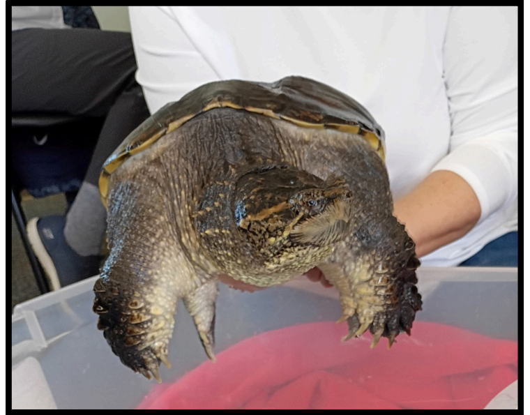
Close up of Mr. Snaps - check out those nails!